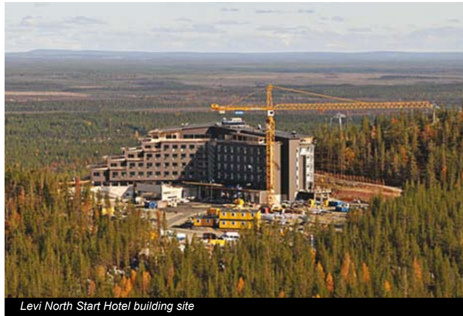
Levi North Start Hotel building site

A complete expression with Tonality facade cladding