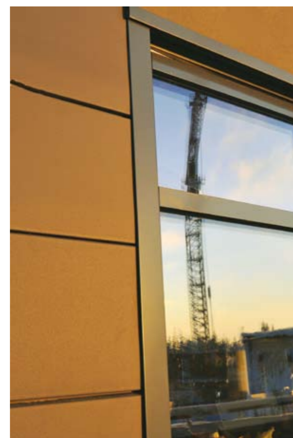
Tonality can be adapted perfectly to the window